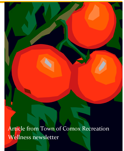
Article from Town of Comox Recreation Wellness newsletter

Many people describe gardening as therapeutic, enriching and meditative. Getting our hands dirty takes us back to our early childhood days when we played in the dirt, watched bugs and lost our awareness of time. It's good for the Soul!