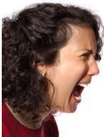
(not exactly as illustrated)

E-mail us at cupe556@members.cupe.ca with 'subscribe' in the subject line.