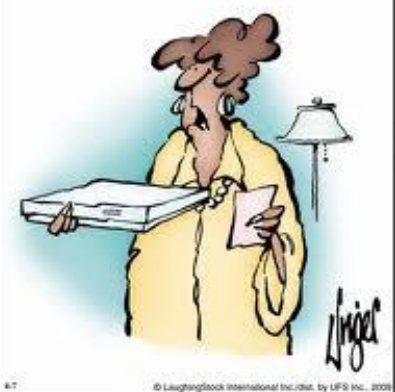
"I don't want to worry you, but the guy who delivered the pizza was your financial planner."